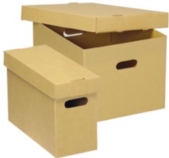
ACID-FREE DOCUMENT STORAGE BOXES