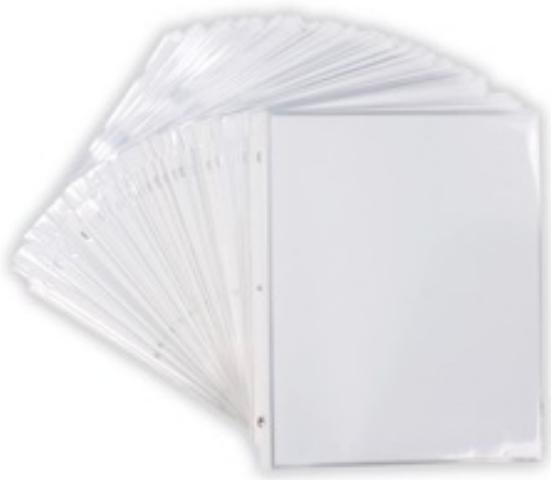
MYLAR SLEEVES FOR PULP DOCUMENTS