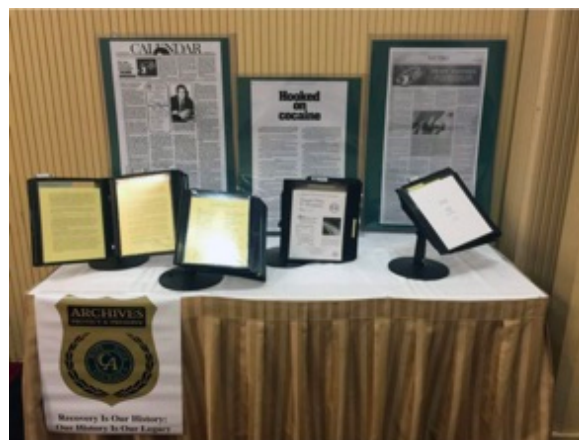
HISTORICAL FLIP BOOKS

https://museum.ca.org/wp-content/uploads/downloads/CAWS-History-Slide-Show.pdf