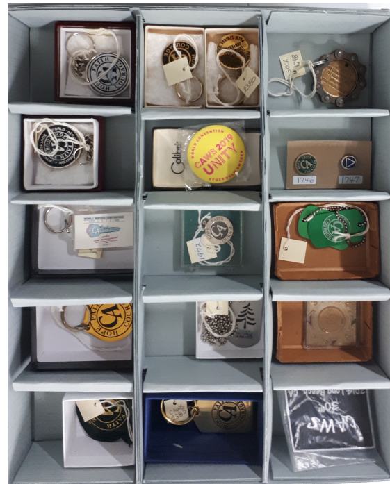
SMALL OBJECTS BOX