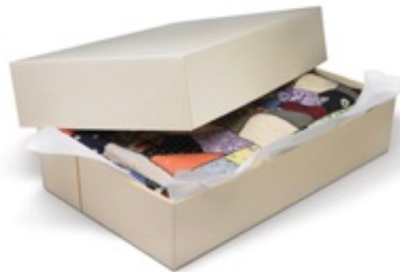
ACID-FREE TEXTILE STORAGE BOX

Dangers to all textiles include: light (both artificial and daylight), dirt, dampness, insects, and excessive heat.